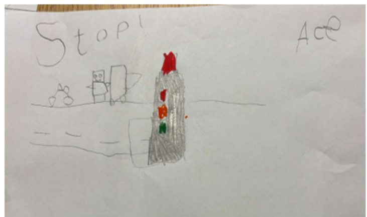
Ace Rodrigues, EYFS